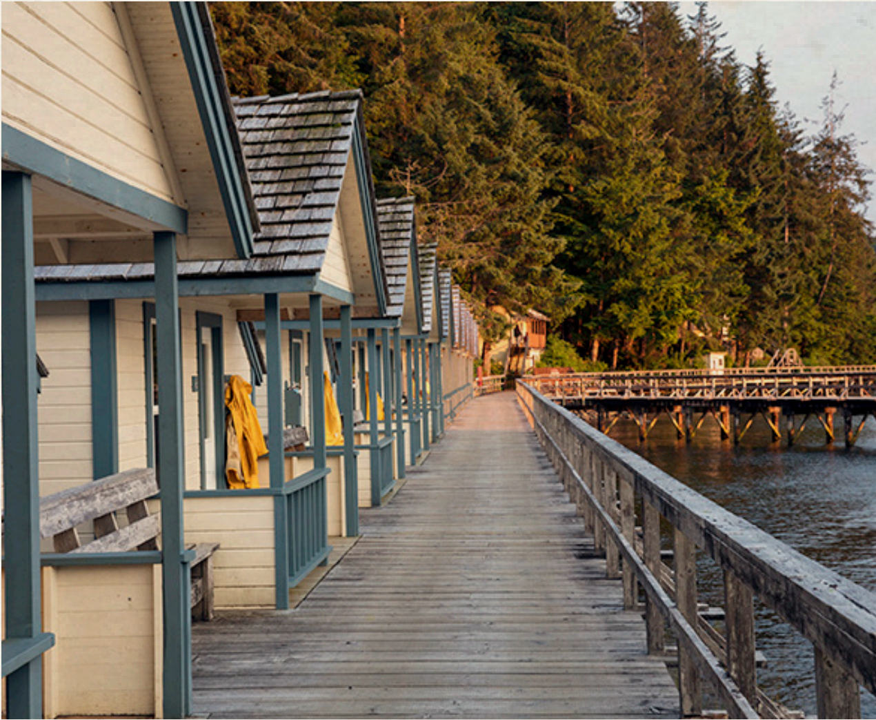
Base Camp Built in 1912 to house cannery crew, the restored Boardwalk Cabins are closest to the boat dock.