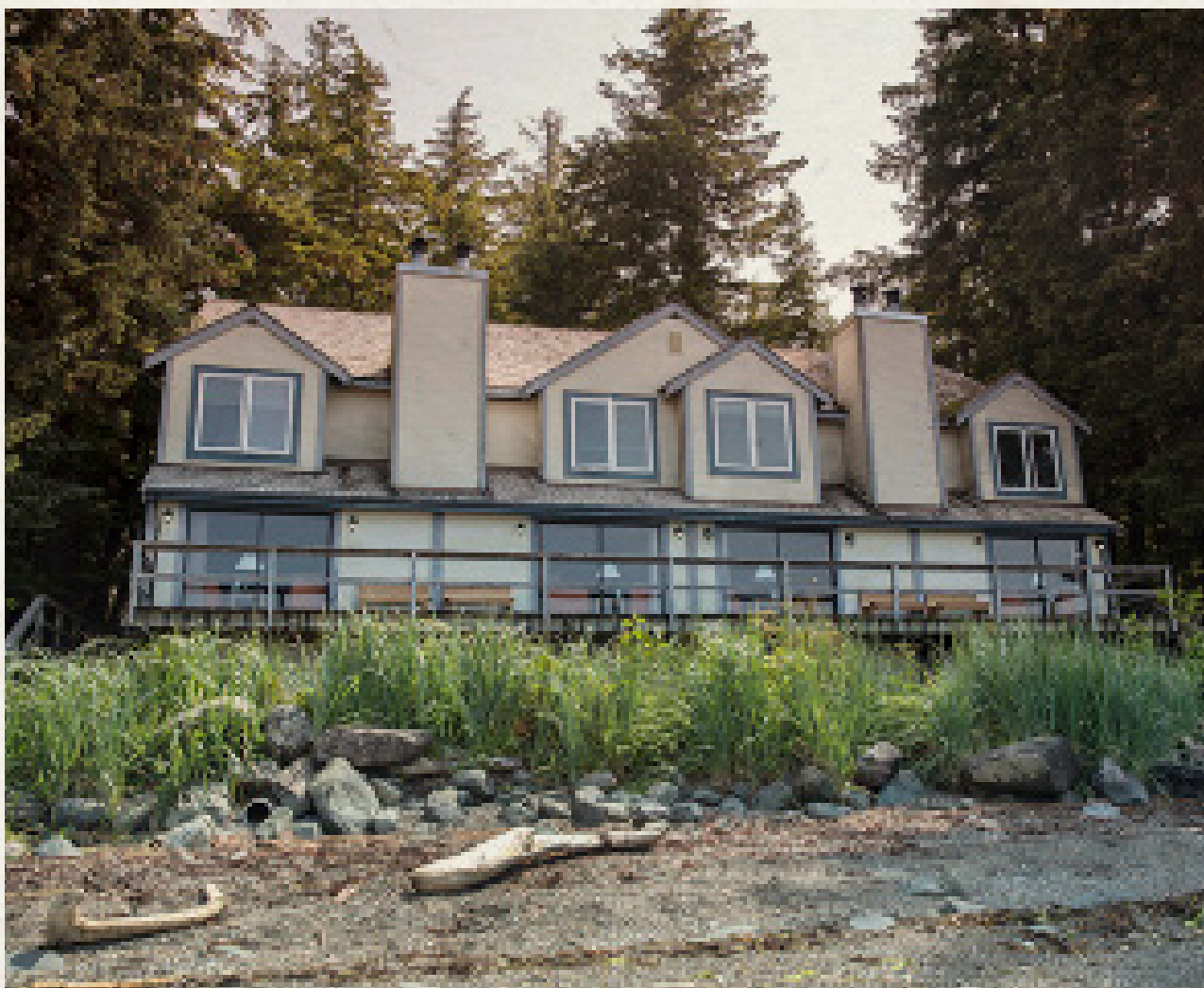
Shoreline Retreat Tucked between the forest and the beach, Tongass Townhouses offer sublime ocean views.