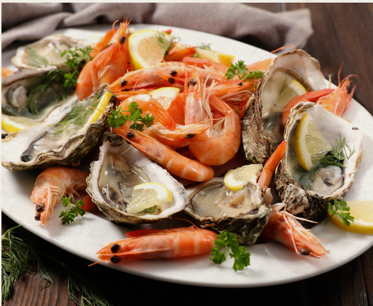
Alaska Fresh Seafood appetizers change nightly, highlighted by oysters, spot prawns, and Dungeness crab.