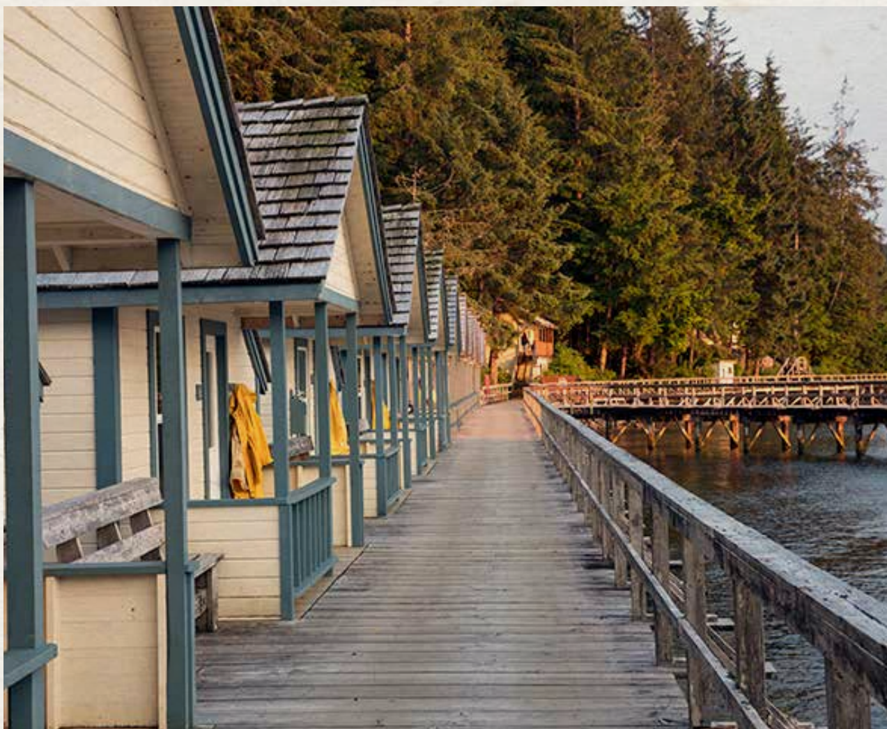
Base Camp Built in 1912 to house cannery crew, the restored Boardwalk Cabins are closest to the boat dock.