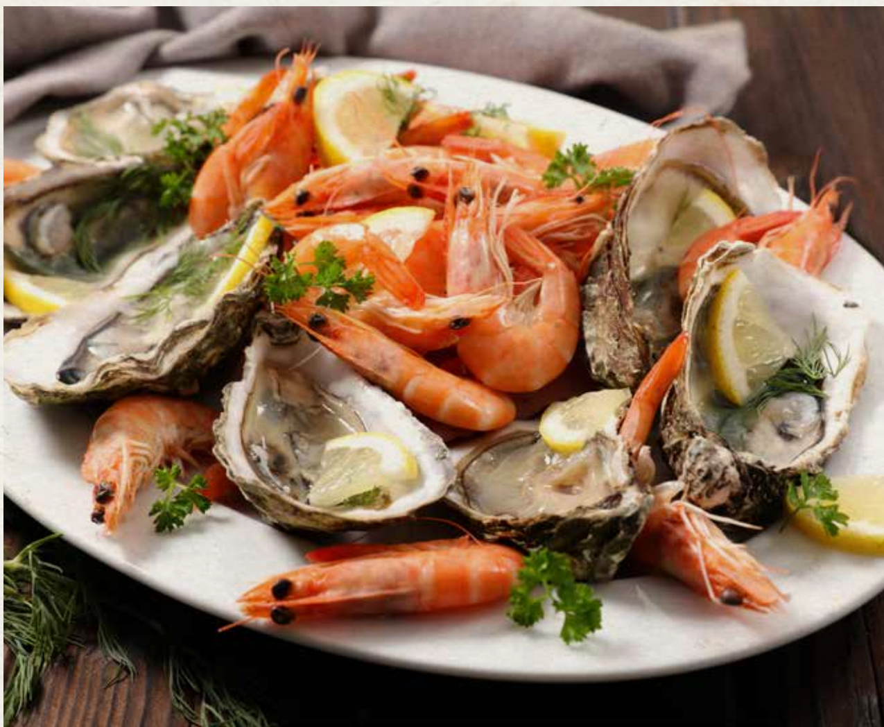
Alaska Fresh Seafood appetizers change nightly, highlighted by oysters, spot prawns, and Dungeness crab.