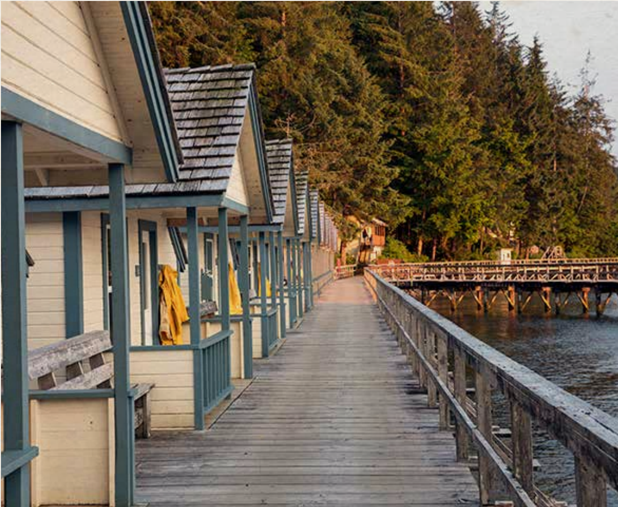
Base Camp Built in 1912 to house cannery crew, the restored Boardwalk Cabins are closest to the boat dock.