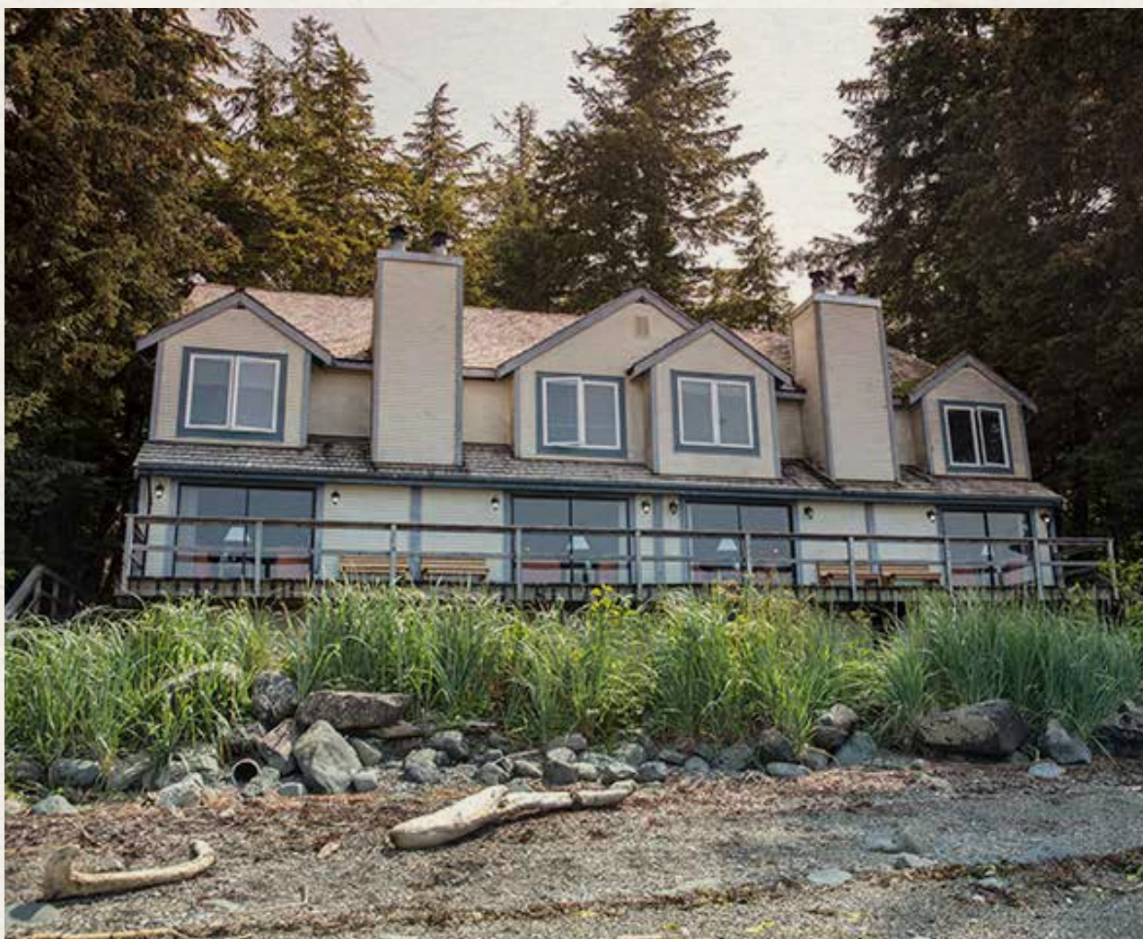
Shoreline Retreat Tucked between the forest and the beach, Tongass Townhouses offer sublime ocean views.